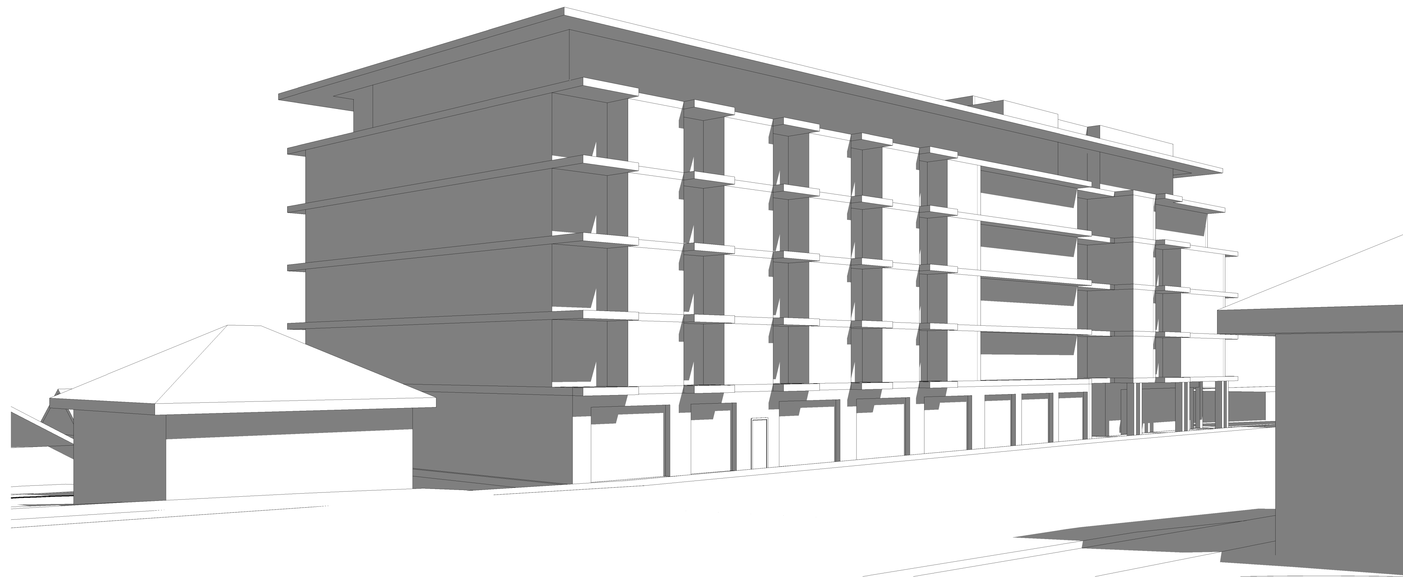
2 View from Nicol Looking SE