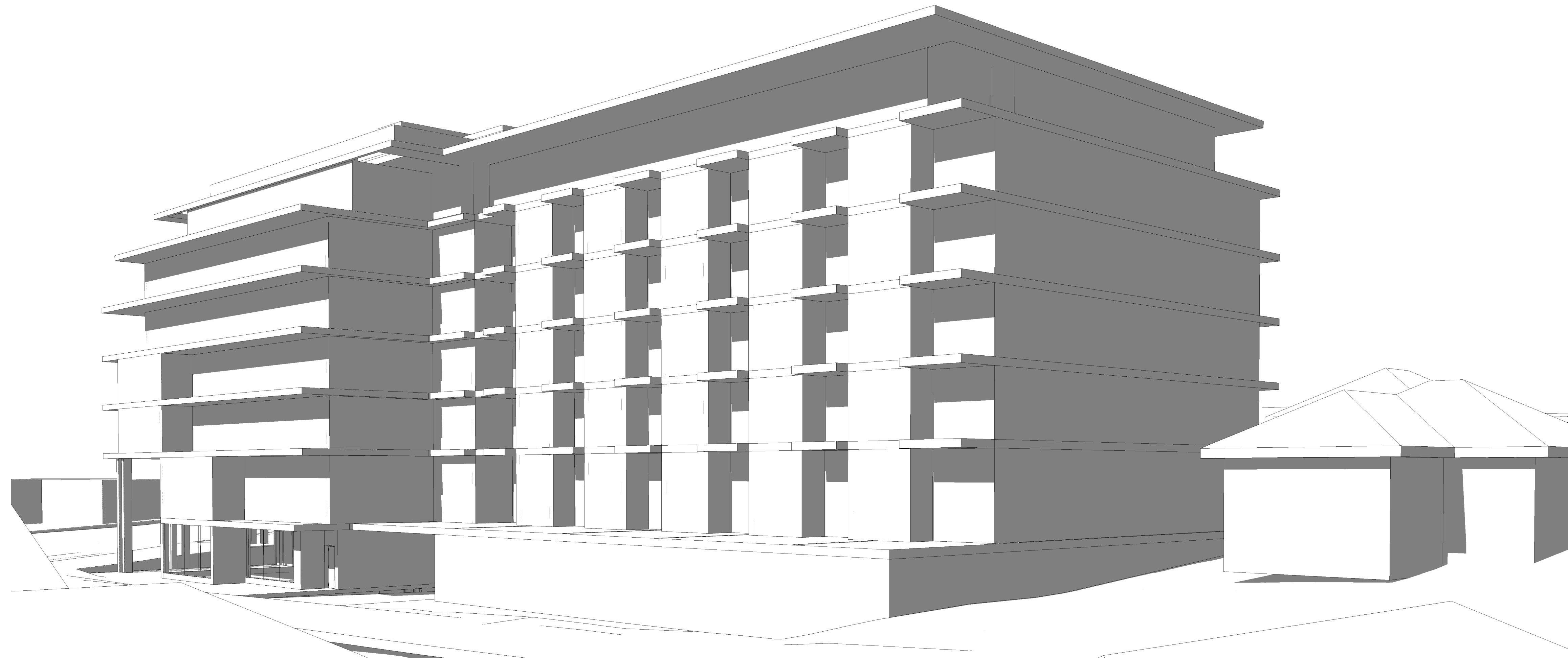
1 View from Lane Lookins SW

Copyright reserved Everything shown hereon for use on this project only and may not be reproduced without the Architect's written permission and unless the reproduction carries their name.