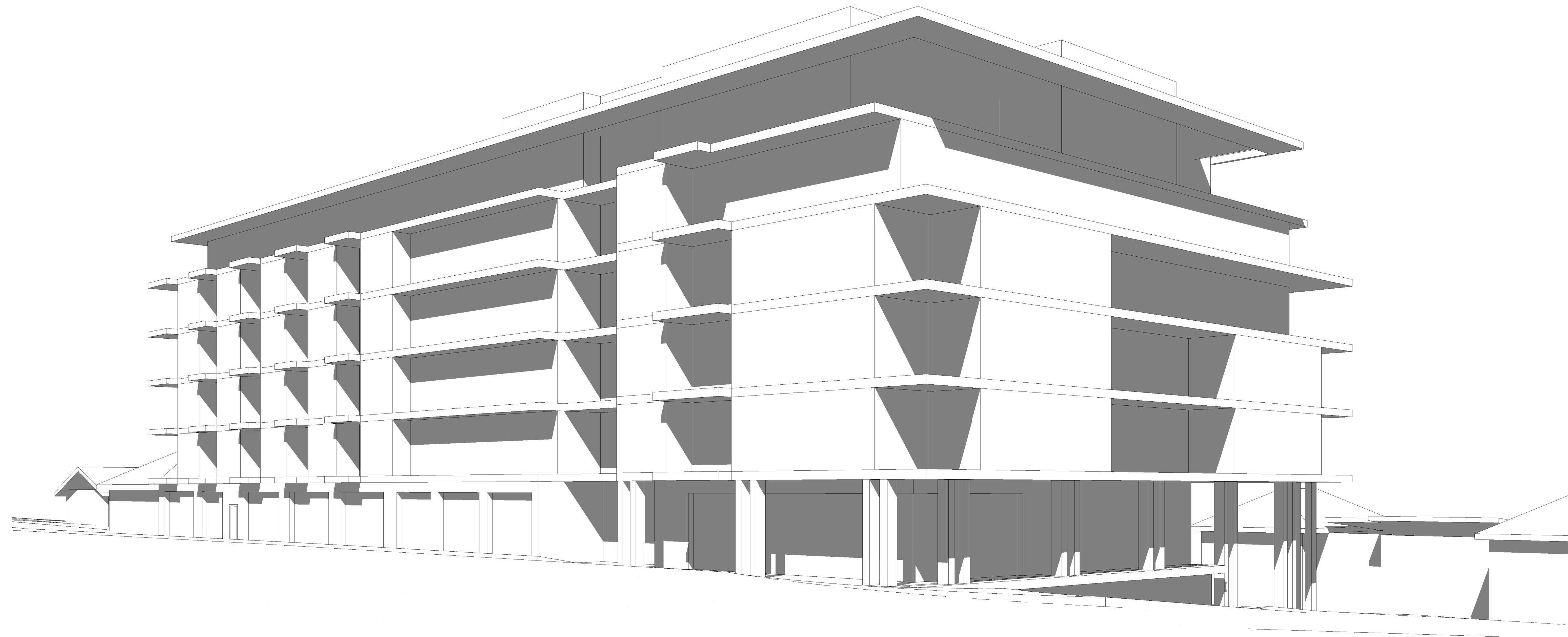
1 View From Nicol Looking NE

Copyright reserved Everything shown hereon for use on this project only and may not be reproduced without the Architect's written permission and unless the reproduction carries their name.